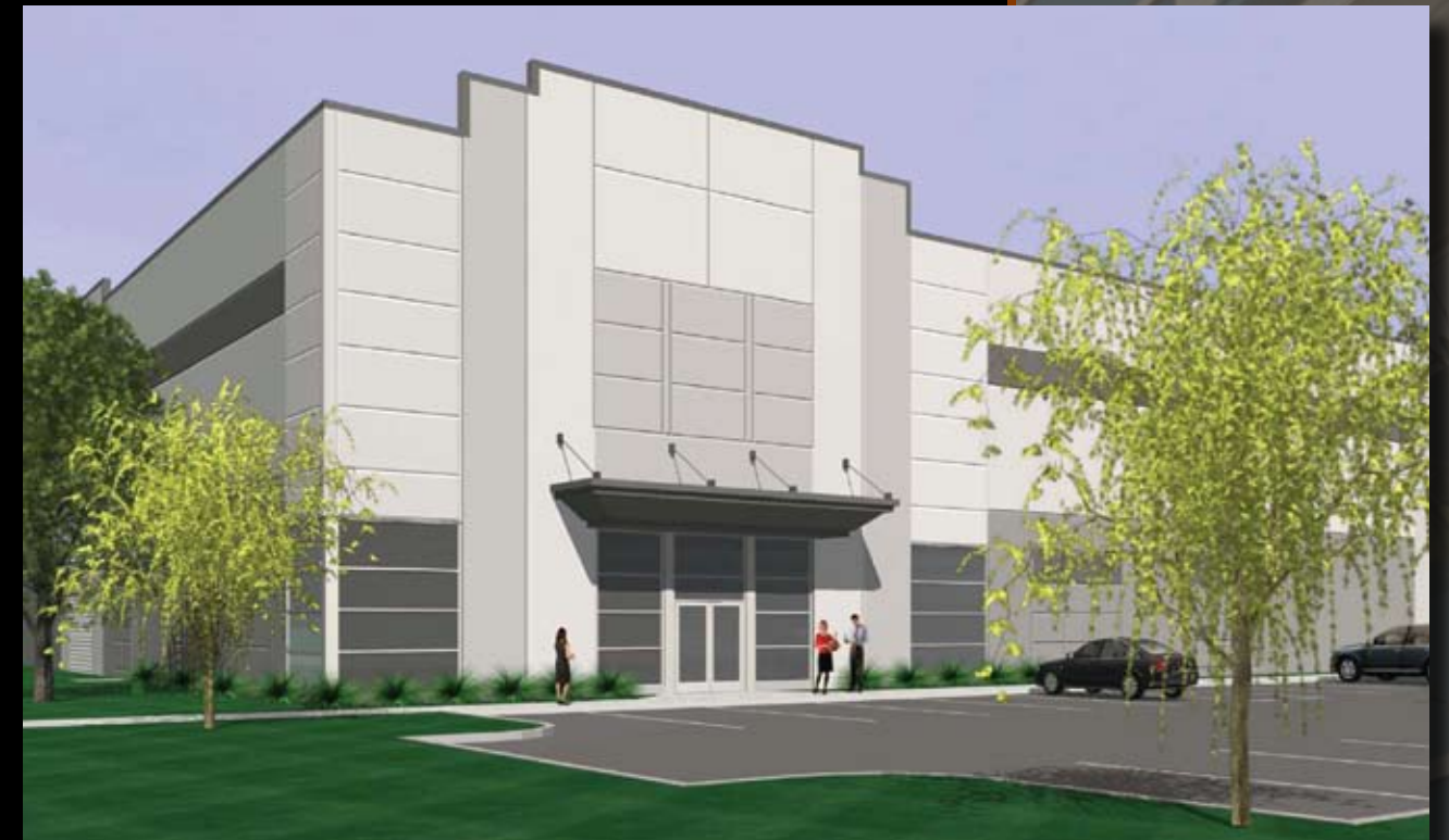
Charleston, South Carolina